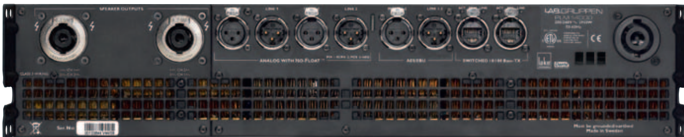
PLM 14000 Neutrik Speakon connector version shown.

The PLM Series Powered Loudspeaker Management systems are equipped as standard with Dante, a self-configuring digital audio networking solution from Audinate® of Australia. Based on the newest developments in networking technology, Dante provides reliable, sample-accurate audio distribution over Ethernet with extremely low latency. Dante incorporates Zen™, an automatic device discovery and system configuration protocol which enables PLM Series products and other products with Dante (like Dolby Lake Processors) to find each other on the network and configure themselves.